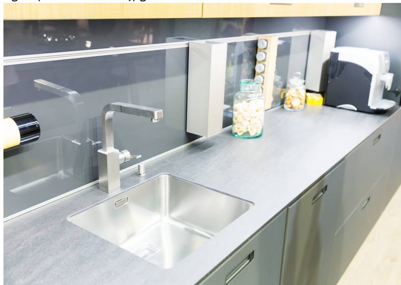
Design Edelstahl Kchen Mit Designer Edelstahl Küche Von Officine Gullo Im Eleganten Retro Auf Modernes Haus Klassische EdelstahlkC3BCche.jpg 1688×1125