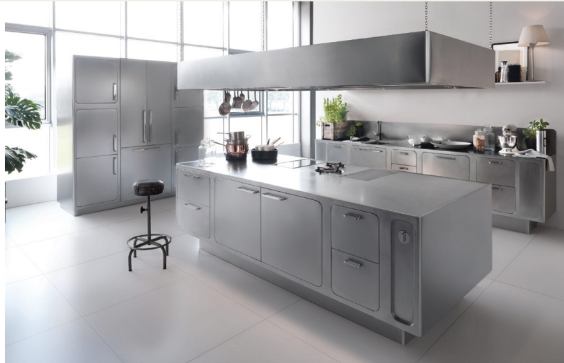
Design Edelstahl Kchen Mit Hubsche Inspiration Küche Kuchen Auf Modernes Haus Atemberaubende Idee Edelstahl Küche Aus Für Gewerbe Ego By Abimis Prisma.jpg 1200×729